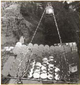
Fig. 3 – Point focus Fresnel reflector first system, Sant'Ilario Station, 1965

For Francia, economic competitiveness was a key factor in a plant's design. The process he followed for the first point focus plant at Sant'Ilario was the reverse of the traditional one. He asked himself what the plant would have to cost to be competitive, and what industry had to offer for the most expensive part, the field of mirrors. He came up with a brilliant solution: a single mechanism that could be mass-produced would turn a whole row of mirrors to focus each one on the boiler (16).